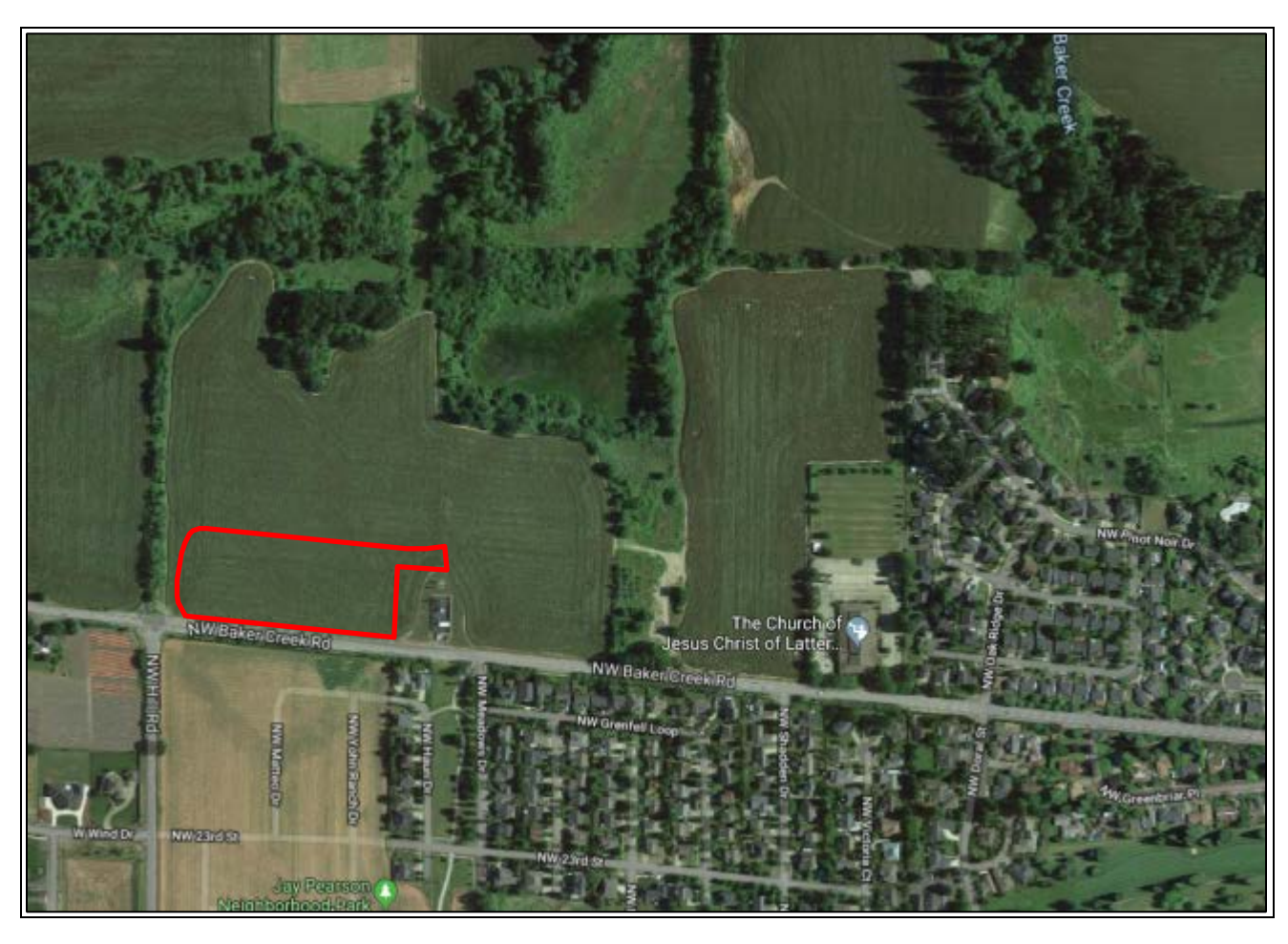
Figure 1. Vicinity Map (Subject Site Area Approximate)